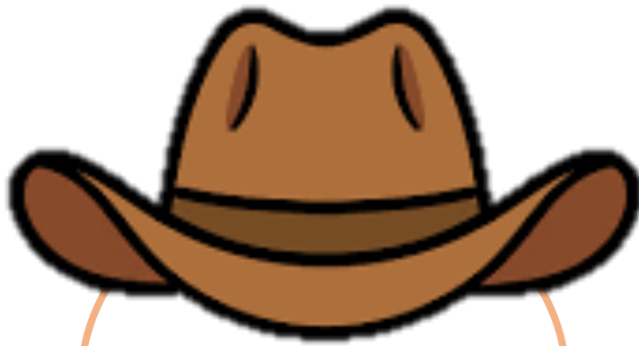
Cowboy Hat (Or Helmet)