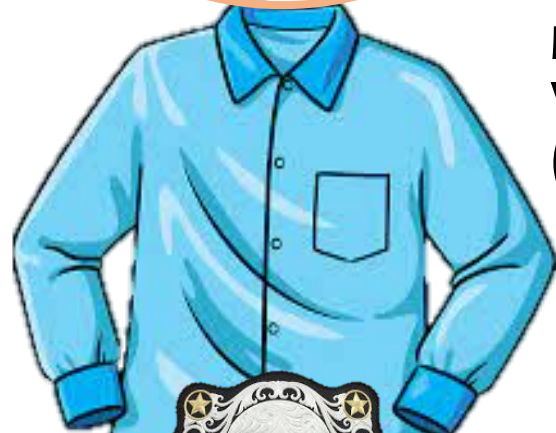
Long Sleeve Western Shirt (collar & cuffs)